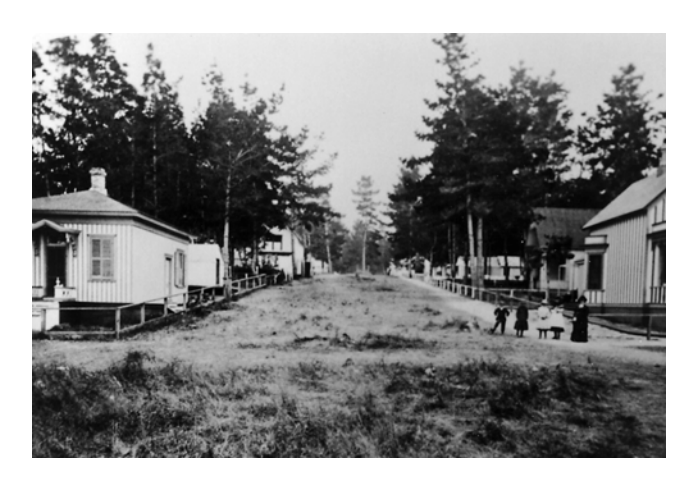
Forest Avenue, 1890s

Other inhabitants of the Monterey Bay Area and Pacific Grove were Chinese immigrants who came to work on the railroad. Many eventually became fishermen and developed a thriving industry based on shipping sea products to the Orient. By 1853, some 500 to 600 people inhabited "Chinatown," located at Point Alones, where Hopkins Marine Station now stands. The Chinese Village was one of the most thriving settlements of its kind on the west coast. In 1906, it burned to the ground, and none of its residents were allowed to return.