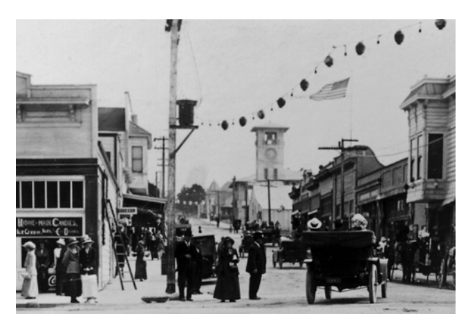
Forest Avenue during a Feast of Lanterns celebration, 1915