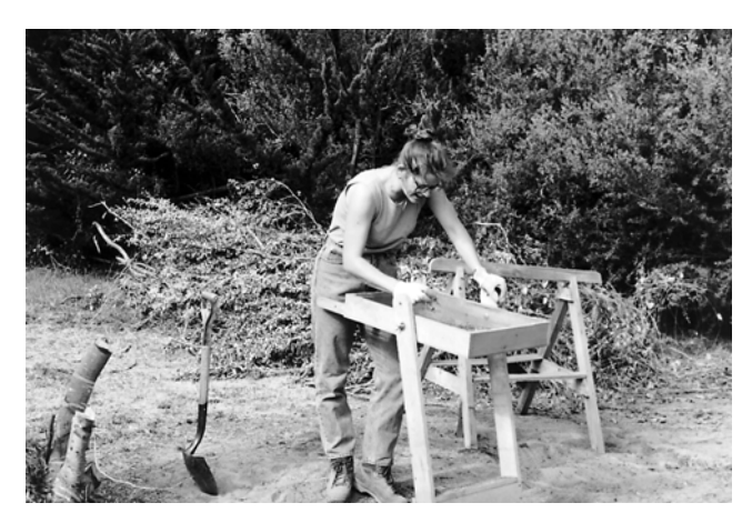
Sifting through the past

The City will take all possible precautions to insure that no action by the City results in the loss of any irreplaceable archaeological record present in the City's planning jurisdiction.