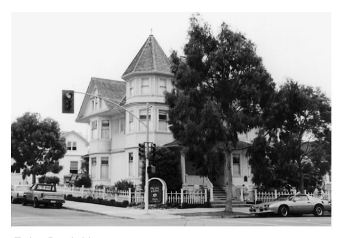
F. L.. Buck House

The city's early growth coincided with the height of technological development in the American building trades, and the completion in 1890 of a national rail transportation system that provided easy access to necessary materials. The 1890s saw the construction of a number of "modern" family homes complete with double walls, second stories, gas and electric fixtures, plumbing, stained glass, wainscotting, plaster ceiling